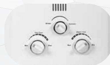
3 ROW TYPE BURNER