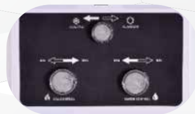
3 ROW TYPE BURNER