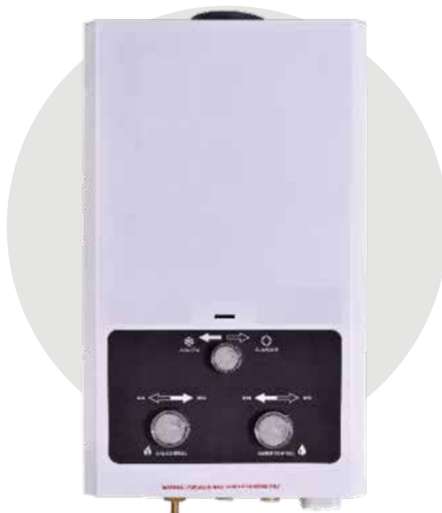
GWH-01 1000/1200 GM