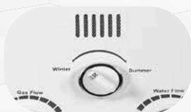
SUMMER & WINTER MODE