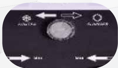
SUMMER & WINTER MODE