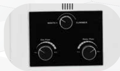
3 ROW TYPE BURNER