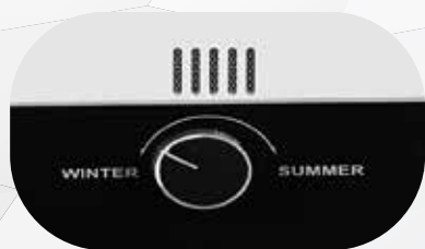
SUMMER & WINTER MODE